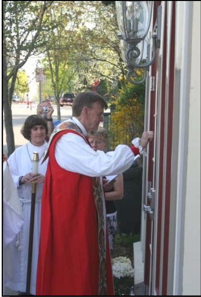
The Opening of the Doors Dedication Sunday