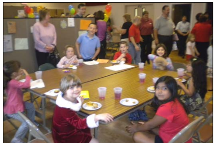
and a party afterwards

For Weekly Announcements and what's happening at St. James', visit our Webpage: