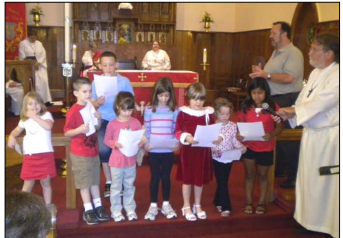
Reading a poem