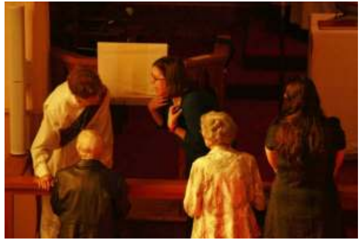
FEAST OF ST. LUKE HEALING SERVICE