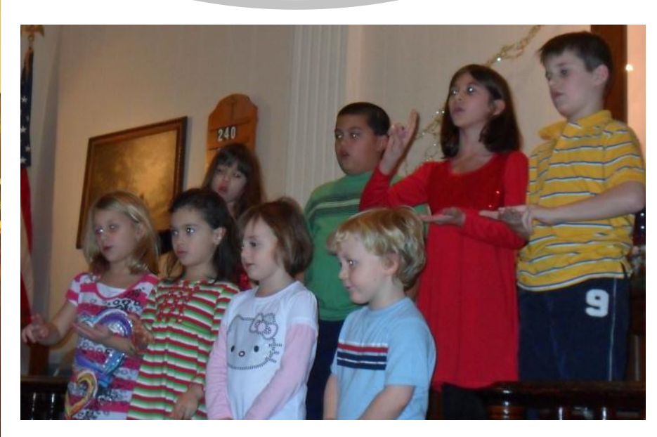
In Christ's Name