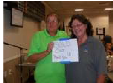
... and turning them away!