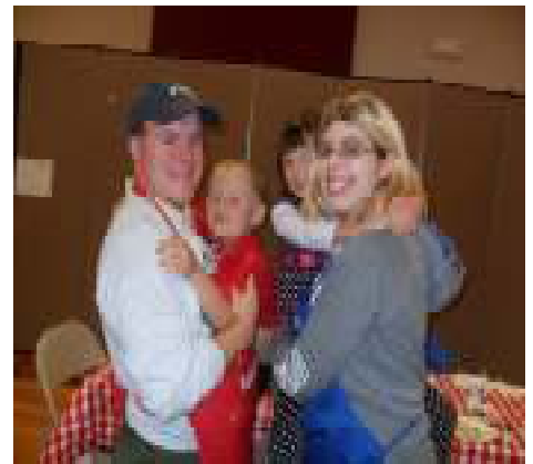
Truly a "family" breakfast!