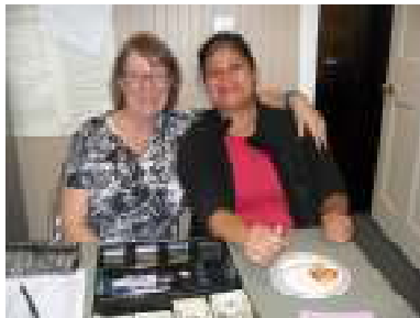
Admitting participants to the Tricky Tray...