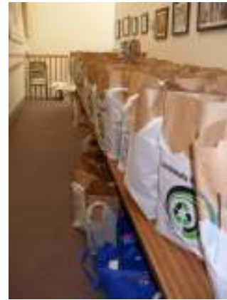
The end of the Summer Backpack Program!