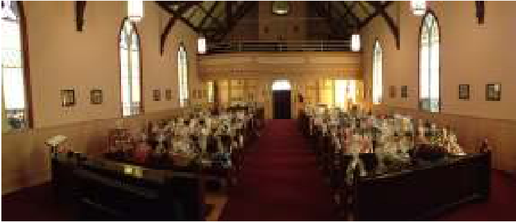
Think people instead of baskets!