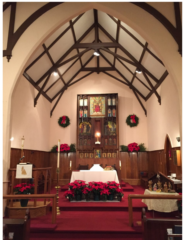
St. James' Altar Christmas 2014